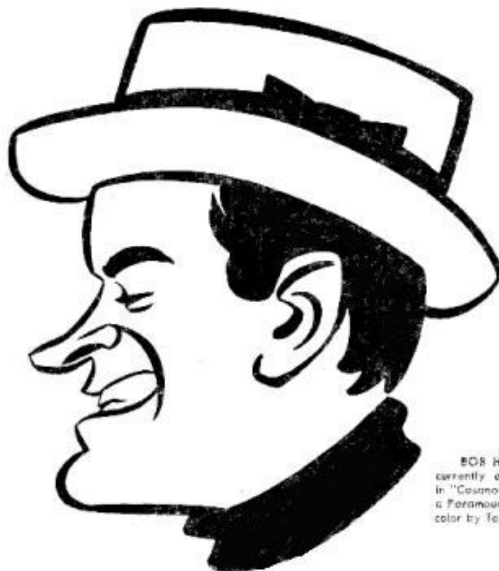
BOB HOPE, currently appearing in "Casanova's Big Night," a Paramount picture, color by Technicolor.