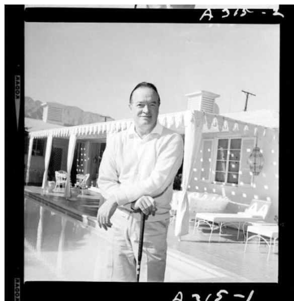
From that same photo shoot