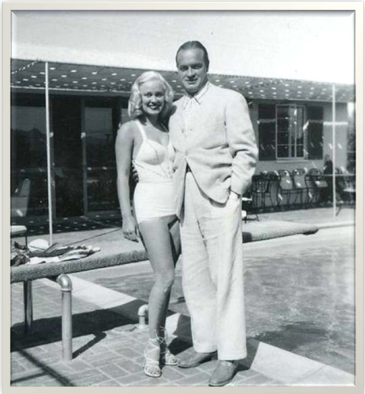
Mamie Van Doren shown here with Bob Hope at the pool area circa late 1940's. She was an American actress, model, singer, and sex symbol who was known for being one of the first actresses to recreate the look of Marilyn Monroe.